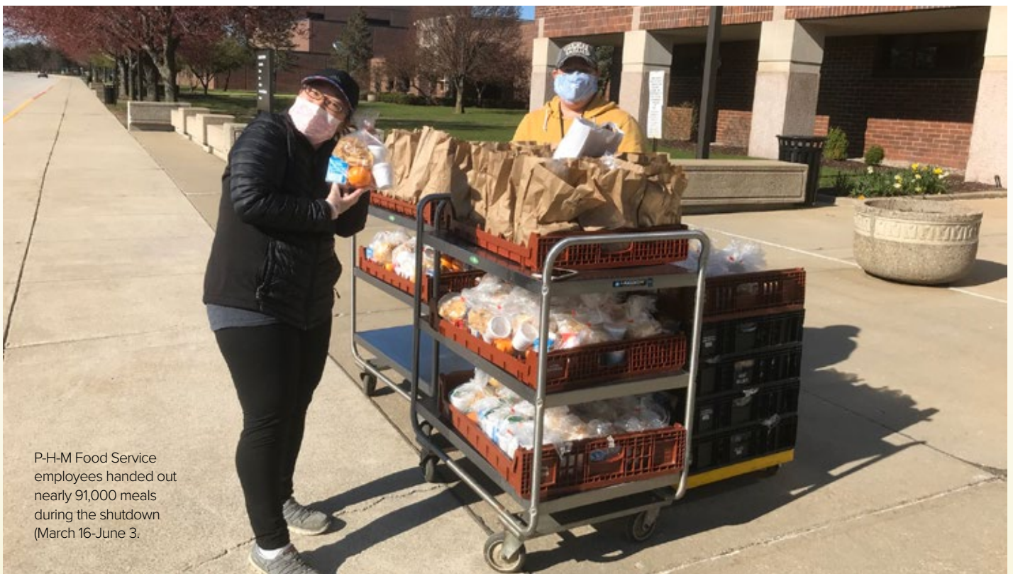
P-H-M Food Service employees handed out nearly 91,000 meals during the shutdown (March 16-June 3).