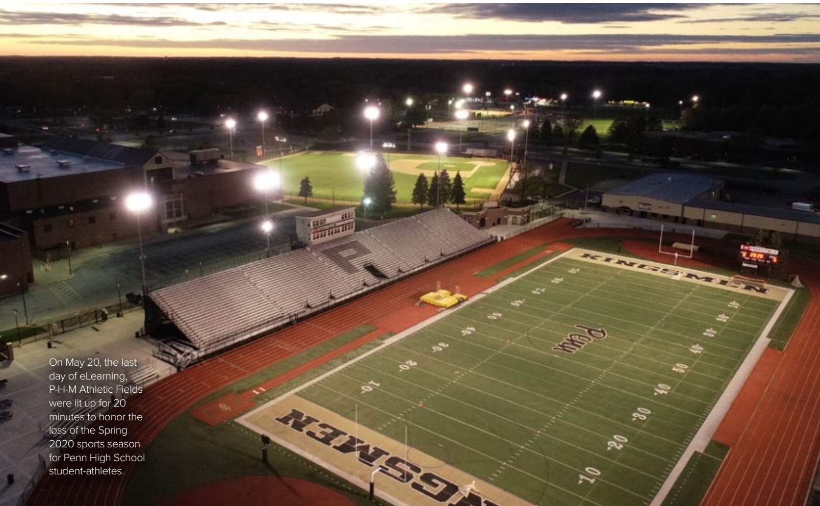
On May 20, the last day of eLearning, P-H-M Athletic Fields were lit up for 20 minutes to honor the loss of the Spring 2020 sports season for Penn High School student-athletes.

We were the first school district in the St. Joseph County area to shut down. While the decision to close was obvious and natural, it wasn’t easy. We knew it would be a huge disruption in the lives of our families. However, while not ideal, instruction could continue by moving out of the classroom and going online. P-H-M is very fortunate to be a 1:1 district and has been utilizing eLearning for seven years. When making the call to cancel school due to the weather, we always ask ourselves, what is the safest choice for our students? Are the students safer staying at home? What are the risks? It is, of course, always more beneficial for students to be in school with teachers for in-person instruction. But having the option to easily transition