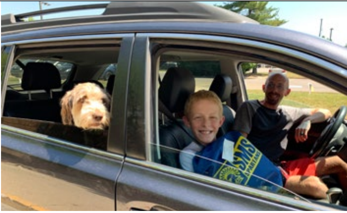
Outgoing 5th grade Bittersweet student picks up her new Schmucker Middle School "swag."

guidance from the Indiana State Department of Health (ISDH) and the Family and Social Services Administration (FSSA). Planning for multiple scenarios for Fall 2020 can now materialize and be finalized. But make no mistake, more hard choices during tough times lie ahead. If the Spring 2020 taught us anything, it's that there is no crystal ball of how things will develop.