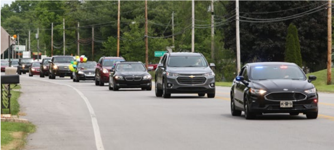
Teachers and staff from Moran Elementary School organized an end of school year parade celebration. The route took them by the homes of 400+ students.

cheering them on in their extra and co-curricular activities. P-H-M staff at every level now shifted focus to helping the school year end as smoothly as possible for our students and families. We would continue to do eLearning until May 20. We would continue to serve nourishing meals three times per